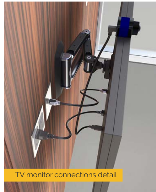
TV monitor connections detail