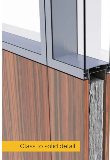
Glass to solid detail