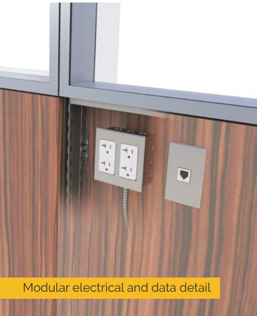
Modular electrical and data detail