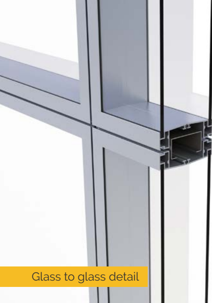
Glass to glass detail