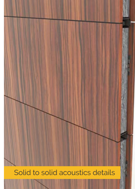
Solid to solid acoustics details